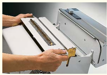
change die easily for different types of punching